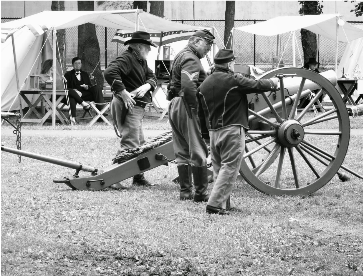
Members of the 6th Independent Battery, New York Artillery at Fort Stevens [i.e., Parker Press Park, Woodbridge, NJ] prepare to fire as President Lincoln and an unidentified lady look on.

Mr. Lincoln had been highly displeased upon learning that Gustavus V. Fox, the Assistant Secretary of the Navy, had ordered two or three gunboats up the Potomac to stand by with steam up in case the present emergency required that the President be evacuated. However, President Lincoln was not content to ride out the storm confined to the White House. Instead he and Mrs. Lincoln, in the presidential carriage, rode out the Seventh Street Road to Fort Stevens to watch the battle in progress on two successive days, July 11th and 12th.